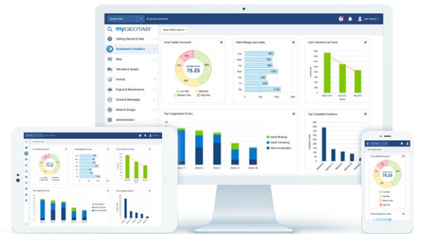
One unified platform